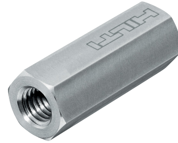
Table 278 - Technical Data and Ordering Information